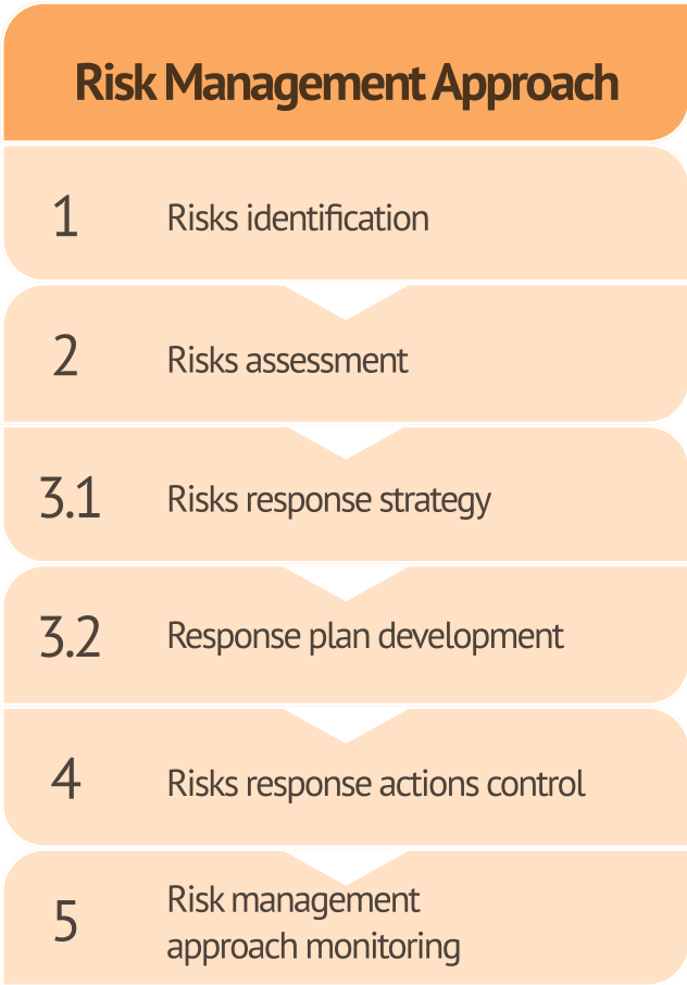
Diagram 2. ERG risk management approach

ERG’s risk management framework is overseen by the Board and the Executive Committee. The ERG-wide risk management policy sets governing principles and corporate objectives for the risk management processes at ERG. Further application of these principles is channeled to all ERG assets, including AoK and KAS, through detailed methodologies, standards and guidelines.